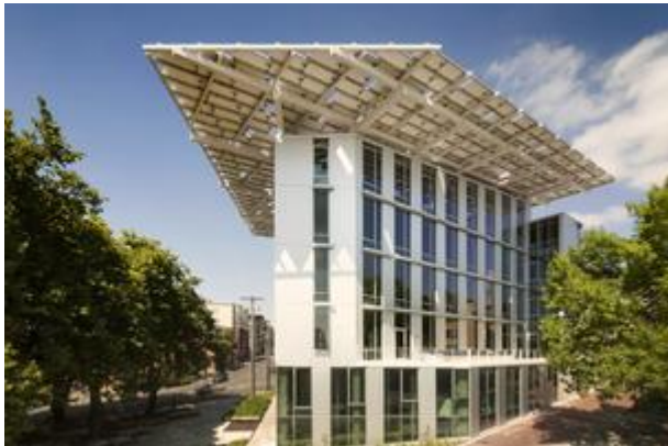
Bullitt Center photo

Unico Properties has been selected to manage the Bullitt Center, a highly sustainable Seattle building that was designed to generate more energy than it uses.