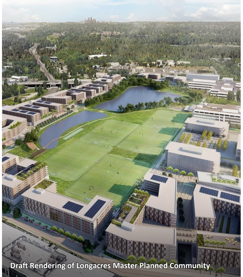
Draft Rendering of Longacres Master Planned Community